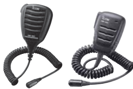
HM-167 HM-202 IPX8 rugged type IPX7 compact type