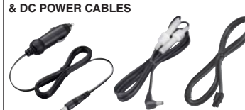
CP-25H OPC-515L OPC-656 For use with For use with For use with BC-210 BC-210 BC-197