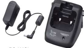
BC-123S* BC-210 Charges the BP-245N in 2.5 hours (approx.). * BC-123SA for 120V AC. SE for 230V AC.