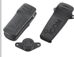
MB-86 MB-103 Swivel type Alligator type