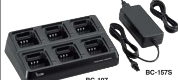
BC-197 BC-157S Charges up to six BP-245N in 2.5 hours (approx.). AD-129 is supplied with the BC-197, depending on version.