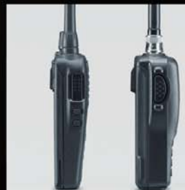
Slim Dimensions IC-V88 (left) and U88 (right)